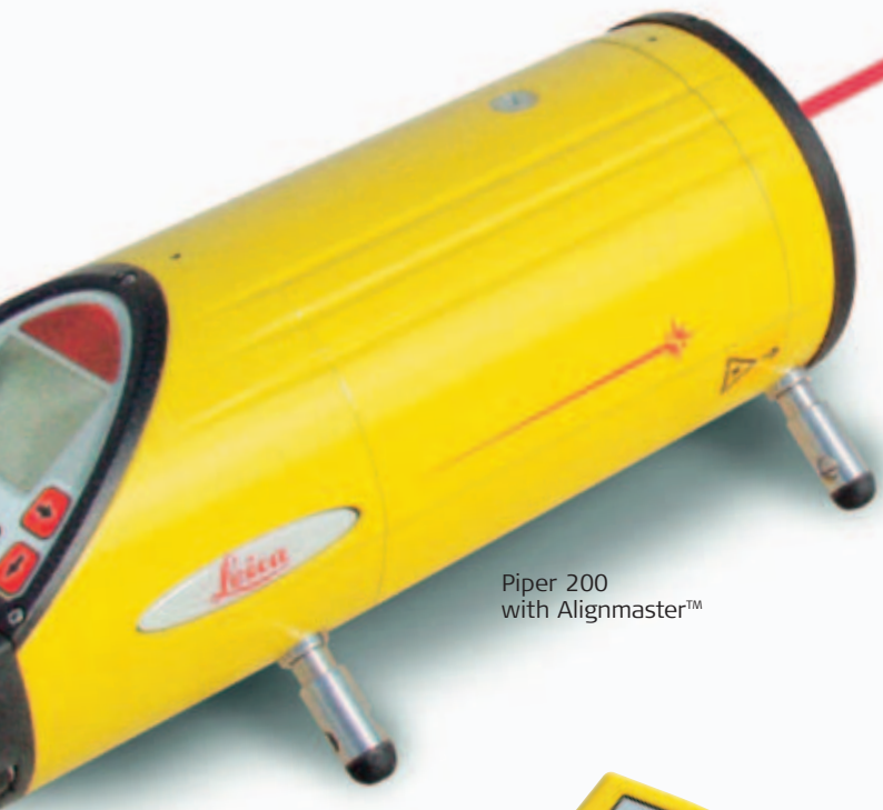
Piper 200 with Alignmaster™