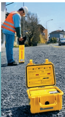
Locate the buried service

For more details of the DIGISYSTEM™ range of products please contact your Leica Geosystems representative.